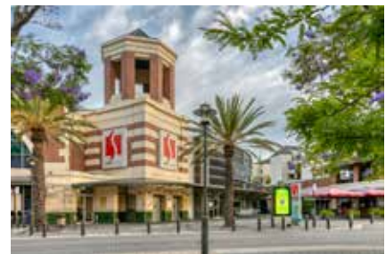
SUBI SQUARE – 29 Station St, Subiaco WA 6008