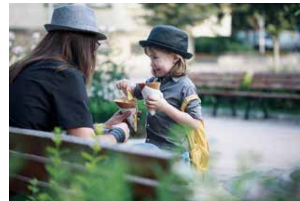
SUBIACO COMMON – Mere View Way, Subiaco