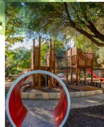
PLAYGROUND – Juniper Bank Way, Subiaco