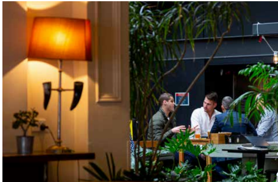
SUBIACO HOTEL – 465 Hay St, Subiaco WA 6008