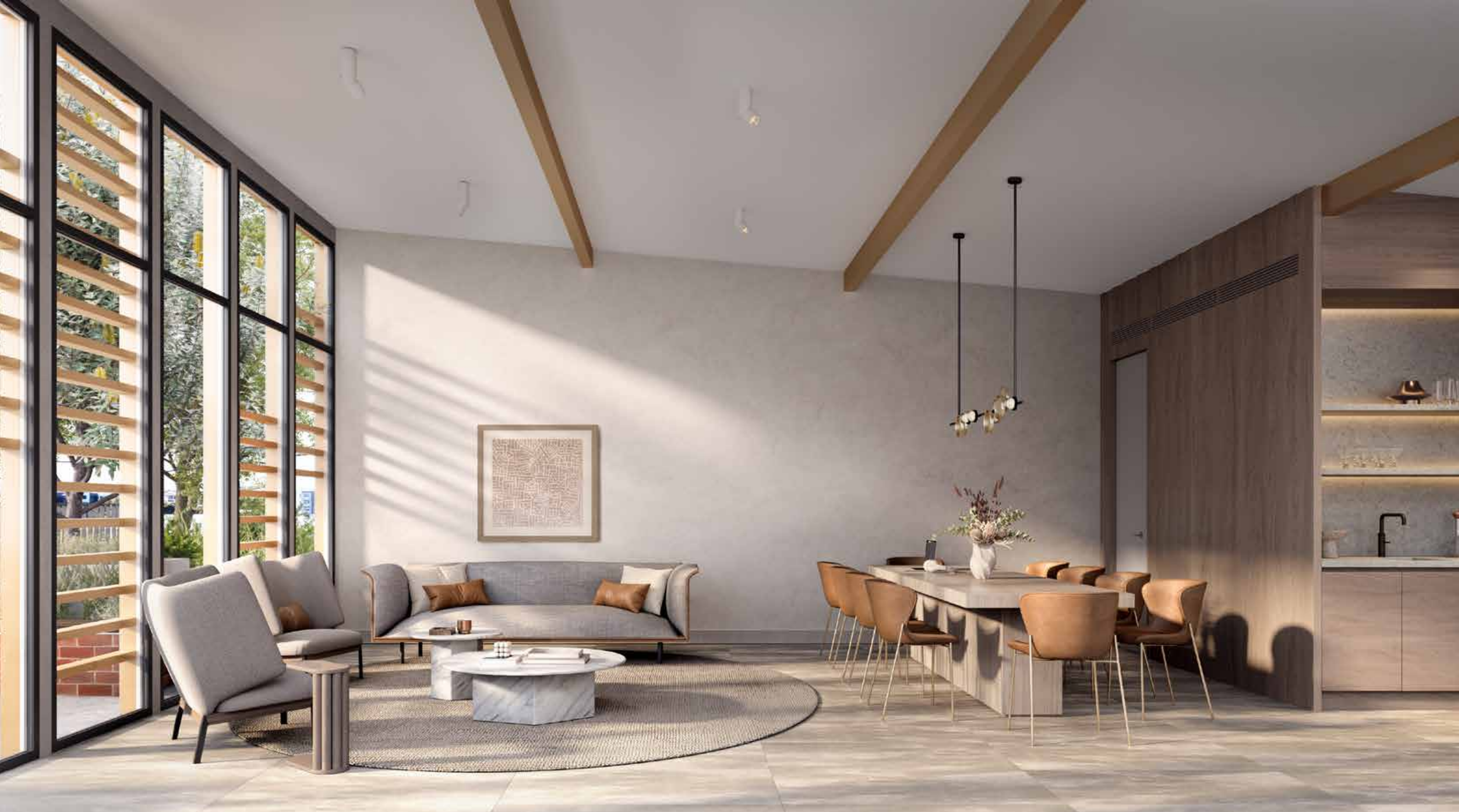
ARTIST IMPRESSION – Residents Flexible Living Space.