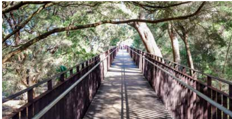
BOTANIC GARDEN – Kings Park