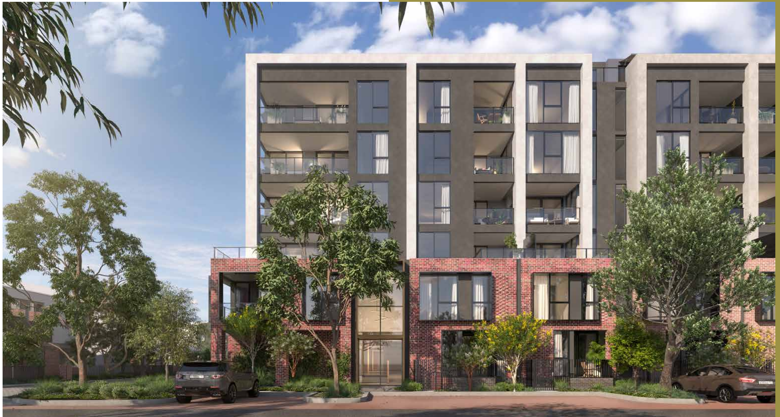
ARTIST IMPRESSION – Incontro Apartments looking East from Bishop Street.