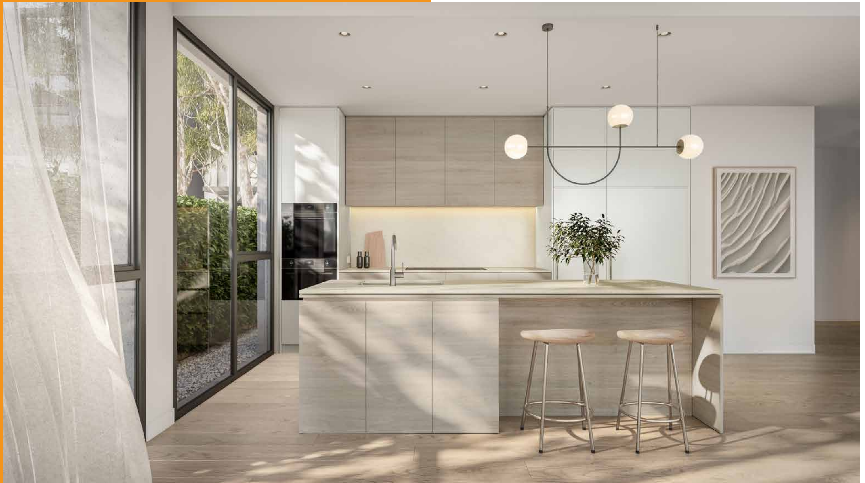
ARTIST IMPRESSION – Kitchen in Ghost Gum scheme, upgrades shown.