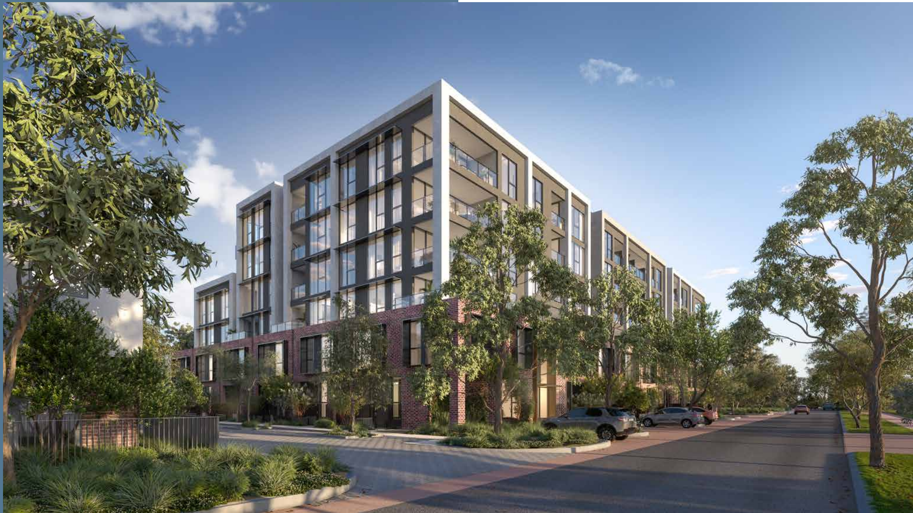
ARTIST IMPRESSION – Incontro Apartments looking Southeast on Bishop Street.