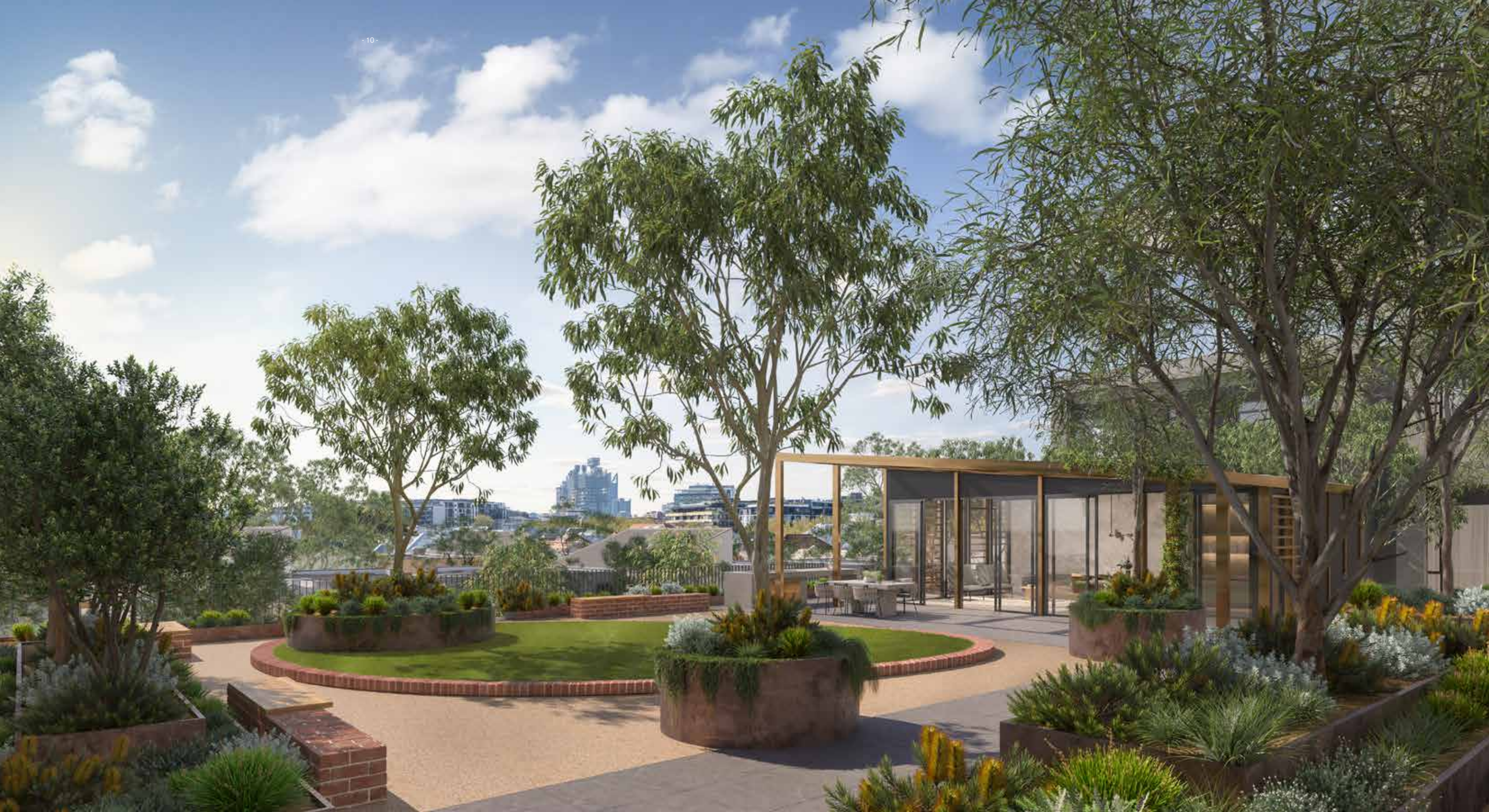
ARTIST IMPRESSION – Level 2 Private Garden Terrace.