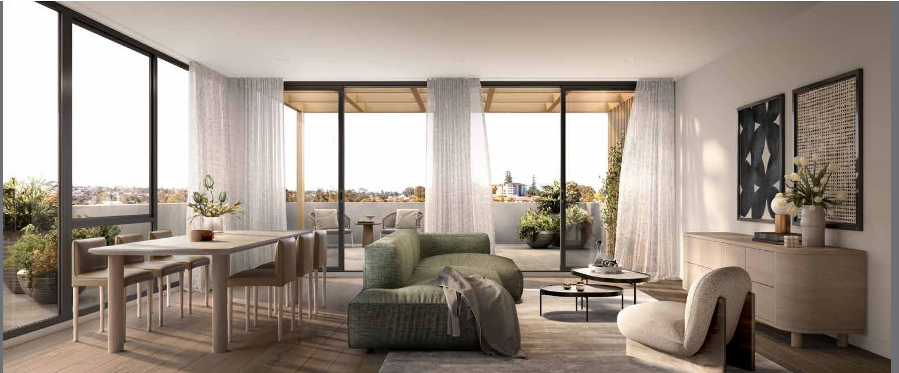
ARTIST IMPRESSION – Light-filled Living and Dining.