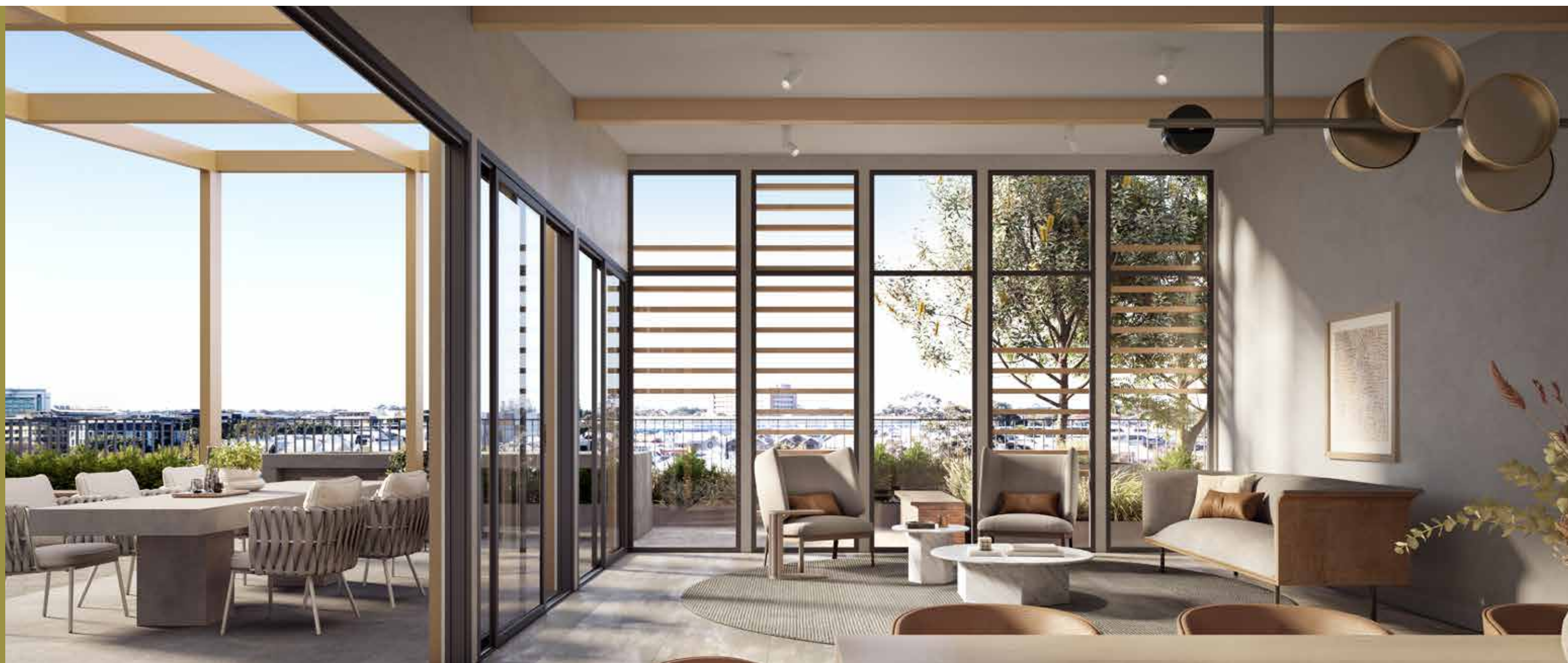
ARTIST IMPRESSION – Flexible Communal Living Space overlooking Garden Terrace.