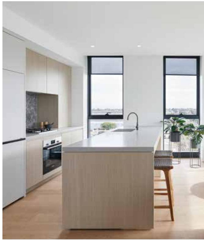
HUNTINGTON APARTMENTS – Victoria