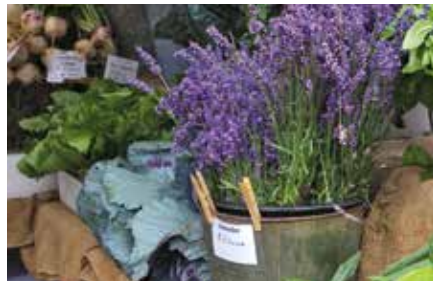
SUBIACO FARMERS MARKETS – 271 Bagot Rd, Subiaco