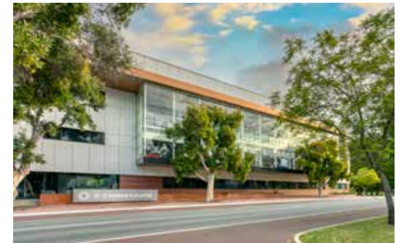
BOB HAWKE COLLEGE – 200 Roberts Rd, Subiaco