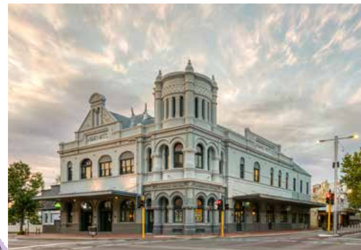
SUBIACO HOTEL – 465 Hay St, Subiaco