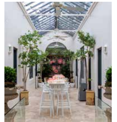
LINNEYS – 37 Rokeby Road, Subiaco