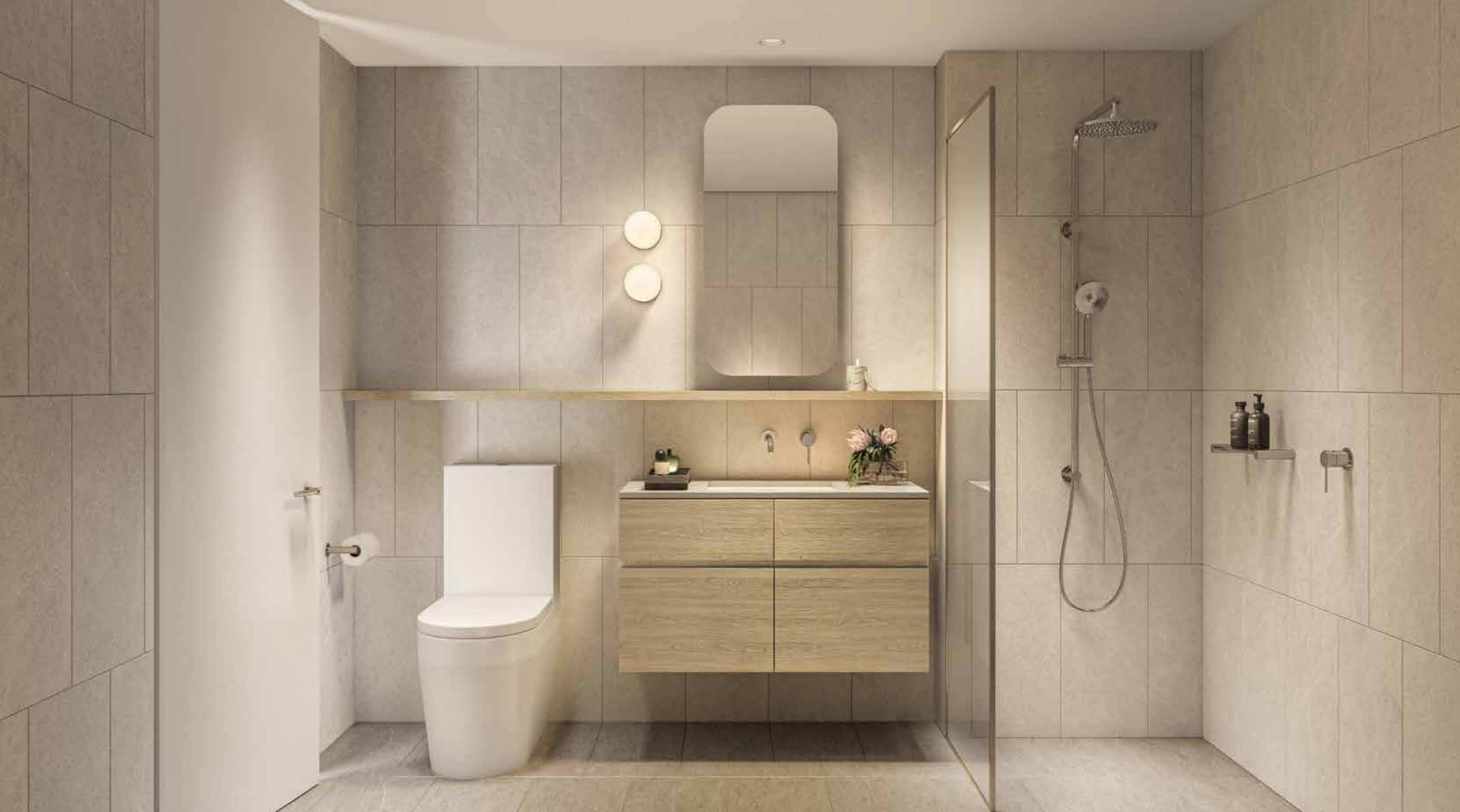
ARTIST IMPRESSION - Bathroom in Ghost Gum scheme, upgrades shown. Shower screen door not shown.