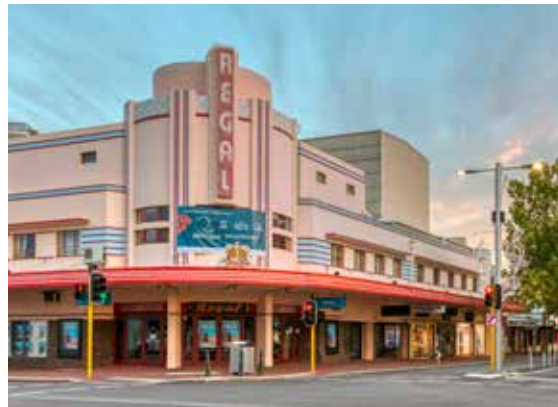
REGAL THEATRE – 474 Hay St, Subiaco