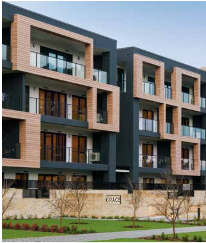
GRACE APARTMENTS – South Australia